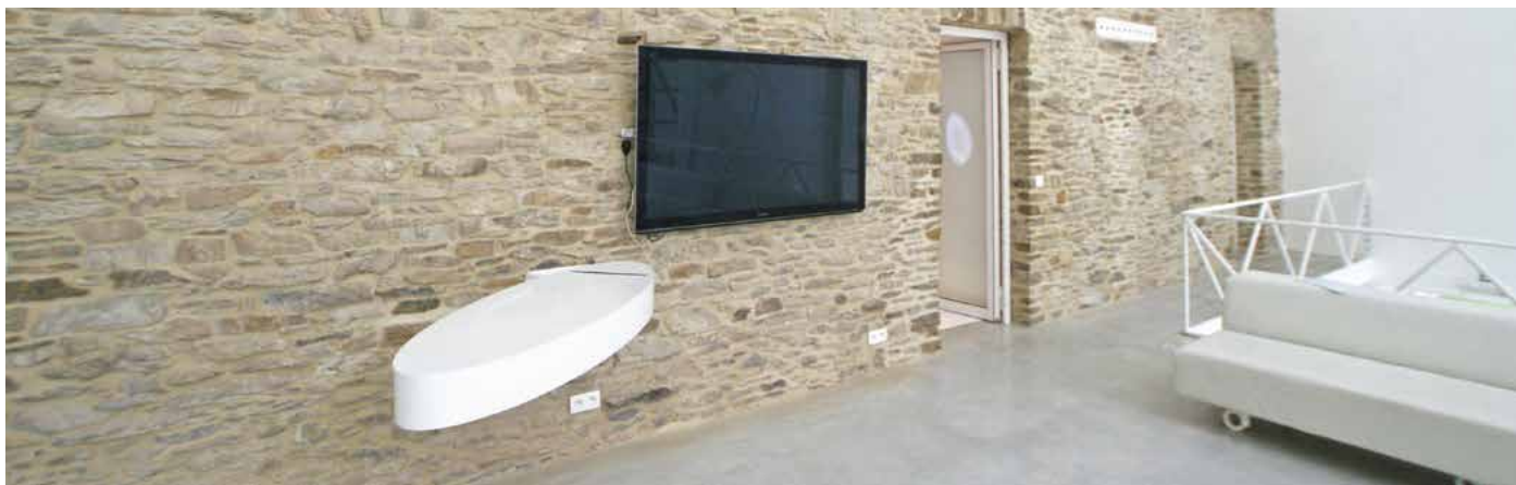
The rotating DJ and speaker table on the first floor.

The two mixers present (one upstairs and one downstairs) allow the sound level to be as desired (up to that maximum) arrange for.